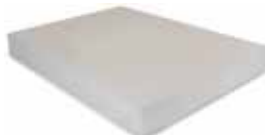
Opens flat for sturdy mattress foundation use.