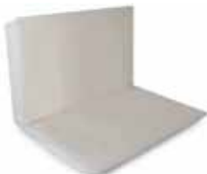
Folds easily – even upholstered.