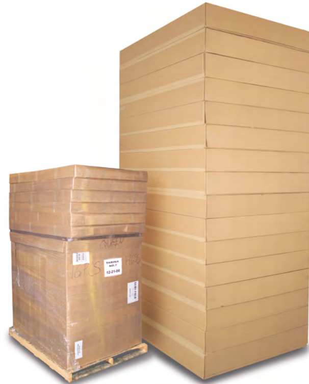
16 Out of the Box Foundations