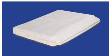
Flattens to ship.